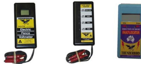
No 5 Fault locator No 8 Digital Volt Meter No 9 Lite Volt Tester